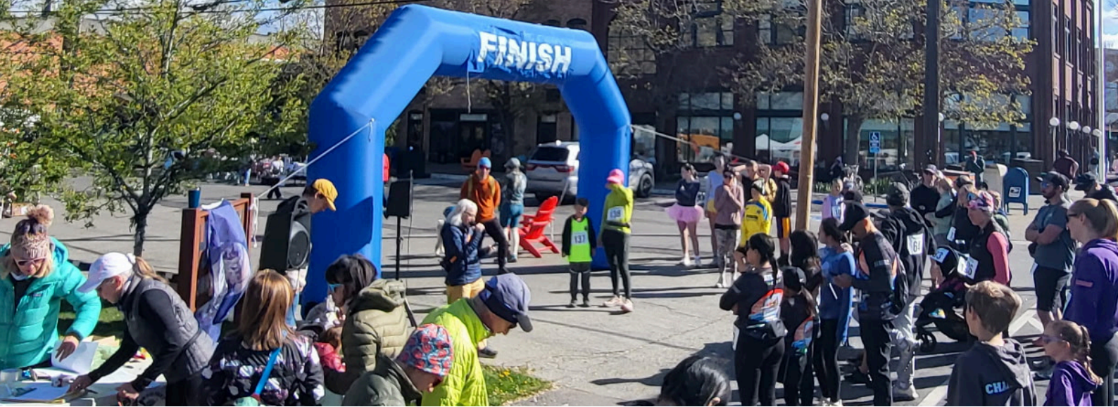
EARTH FEST CELEBRATION 2026